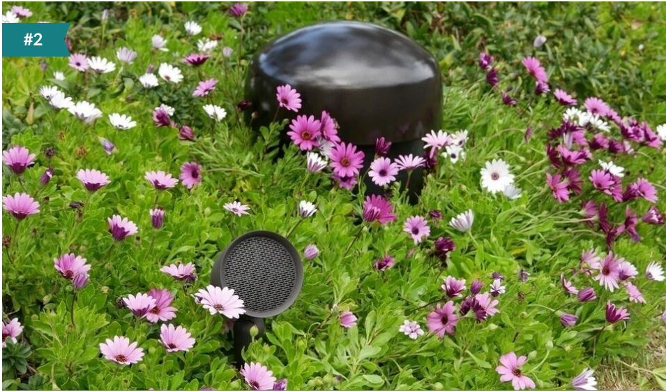
GARDEN SERIES 8.1 SYSTEM + SONANCE AMPLIFIER